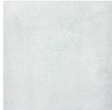
DAK63660 PEI 5 ○ 560 | m 2 matt