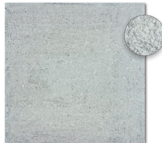
DAR63661 PEI 5 ○ 560 | m 2 matt