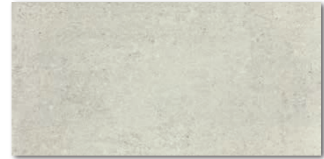
DAKSE662 PEI 5 ○ 540 | m 2 matt