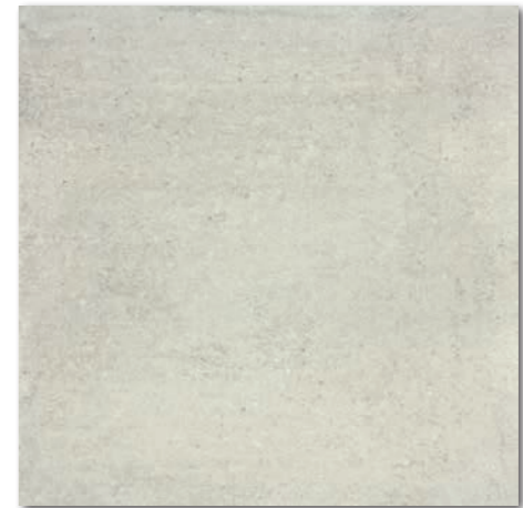
DAK63662 PEI 5 ○ 560 | m 2 matt