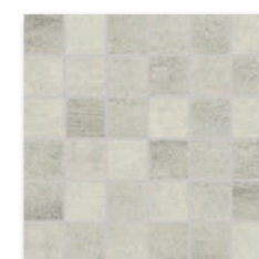
DDM06662 (SHEET) PEI 5 ○ 440 | Netz matt grau-beige | grey-beige