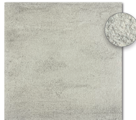
DAR63662 PEI 5 ○ 560 | m 2 matt