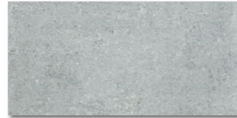
DAKSE661 PEI 5 ○ 540 | m 2 matt