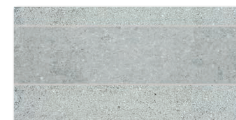
DDPSE661 (SHEET) PEI 5 ○ 530 | Netz matt