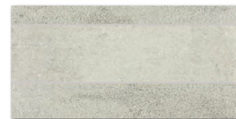
DDPSE662 (SHEET) PEI 5 ○ 530 | Netz matt