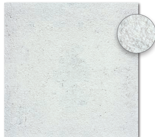
DAR63660 PEI 5 ○ 560 | m 2 matt