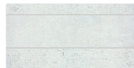
DDPSE660 (SHEET) PEI 5 ○ 530 | Netz matt