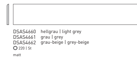
DSAS4660 hellgrau | light grey DSAS4661 grau | grey DSAS4662 grau-beige | grey-beige ○ 220 | St matt