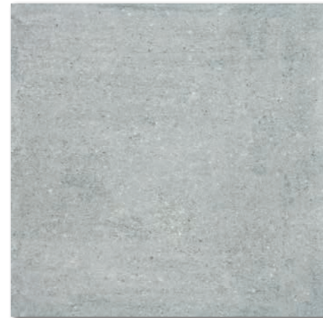
DAK63661 PEI 5 ○ 560 | m 2 matt