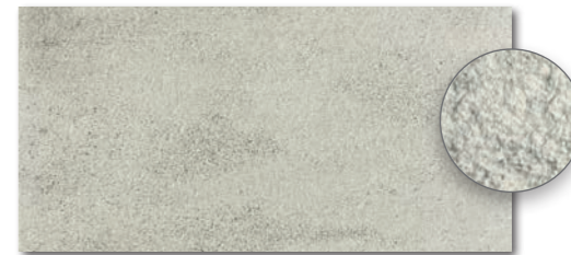
DARSE662 PEI 5 ○ 540 | m 2 matt | R10 | B grau-beige | grey-beige