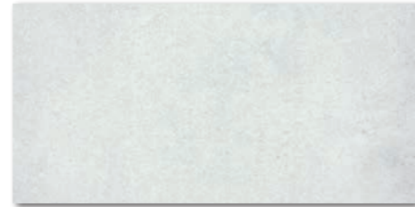
DAKSE660 PEI 5 ○ 540 | m 2 matt