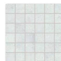
DDM06660 (SHEET) PEI 5 ○ 440 | Netz matt hellgrau | light grey